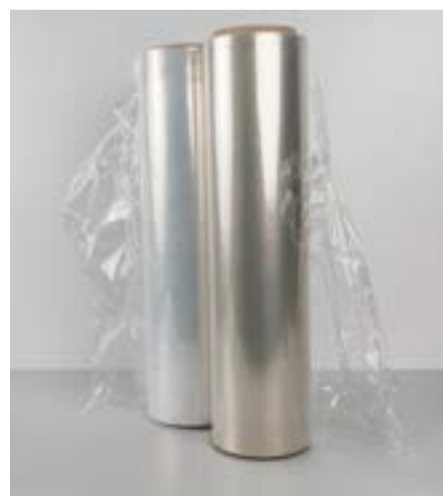
Ready to process PIR and PCR resins

LIGHTER CORES OR EVEN CORELESS Another key feature of the winder W4000-4S3T is the possibility to run thinner cores. When the core thickness is reduced, the CO 2 e.g. in stretch film production is minimised in the same way. "Of course, the most sustainable solution would be the production of stretch film completely without cores. And this is something which can also be accomplished with our latest innovation", Thomas Rauscher adds.